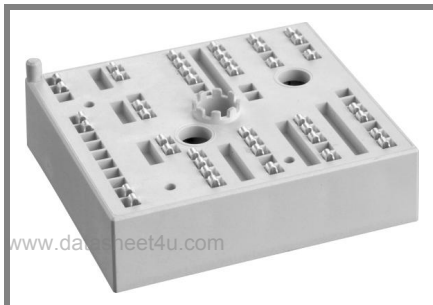
MiniSKiiP ® 2

3-phase bridge rectifier + brake chopper + 3-phase bridge inverter SKiiP 24NAB12T4V1